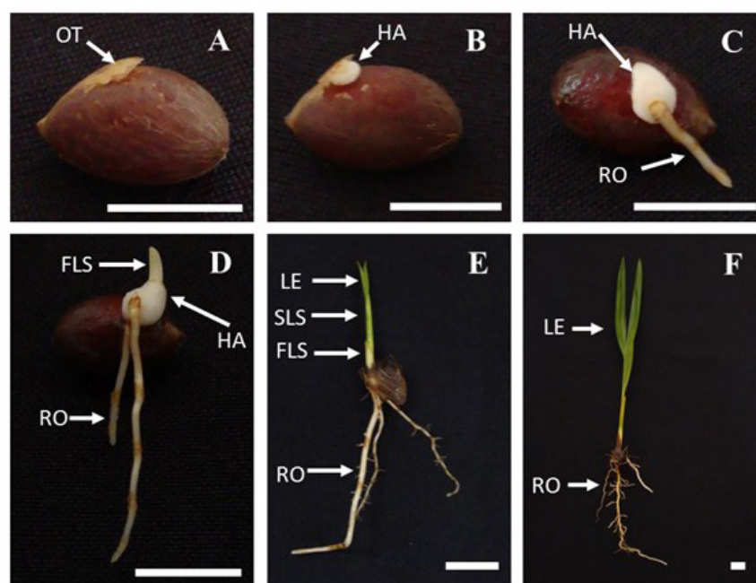
Figure 2. Morphology of the seed and seedlings of Areca palm seedless. OT = opercular tegument; HA = haustorium; RO = roots; FLS = first leaf sheath; SLS = second leaf sheath; LE = leaflet. Bars = 1.0 cm.

The seed germination of Areca palm is hypogeal, while development is initiated from an undifferentiated mass of cells in the observed at 47 days after sowing by opening of opercular tegument (Figure 2A).